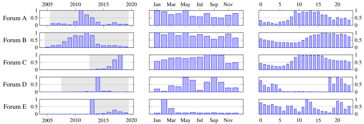
Figure 1: Histograms (normalized to maximum bin value in forum) for (left) postings per year, with shading indicating the years for which we have post data for the forum, (middle) postings per month of year, and (right) postings per hour of day.